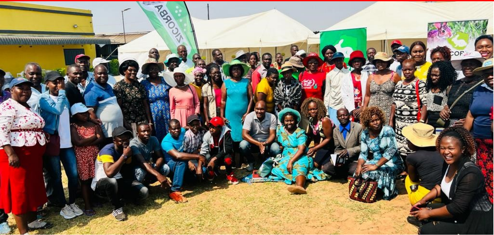
Group photo of rabbit farmers and would-be rabbit producers who attended a Rabbit Farmers Day hosted by ZICORBA at Gokwe Centre