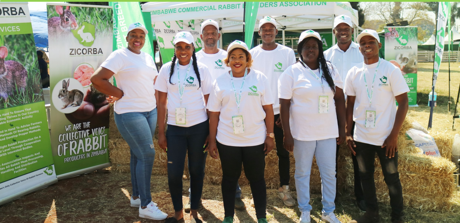
The ZICORBA team pose for a photo at their stand during the Zimbabwe Agricultural show 2022 edition

The Zimbabwe Commercial Rabbit Breeders Association (ZICORBA) made a debut at the 2022 Zimbabwe Agricultural Show, scooping 16 prizes – probably the biggest number of awards by a single organisation in the history of the show.