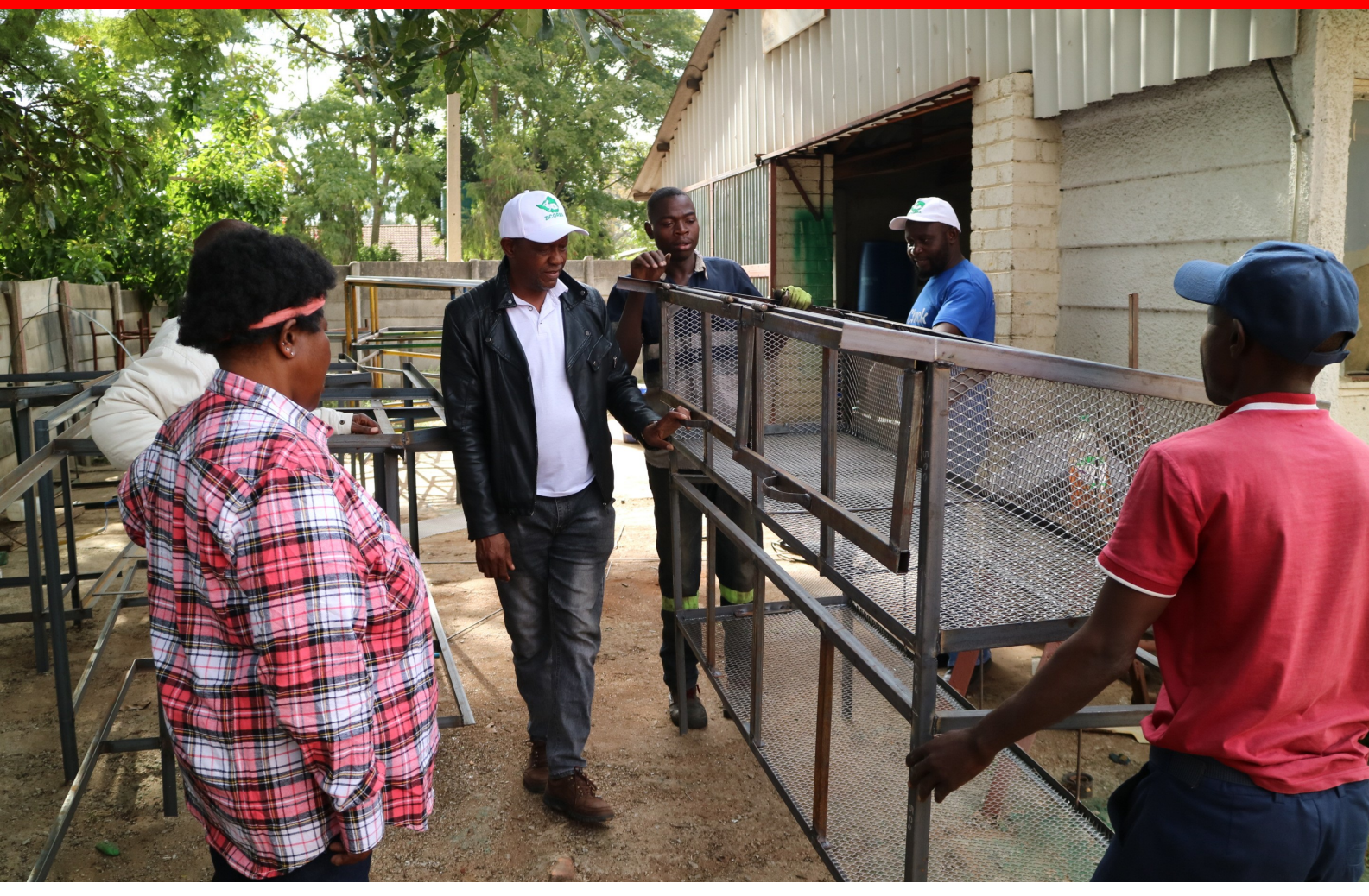
ZICORBA Mashonaland East Chapter discussing the proposed model rabbit cage during their strategic planning meeting

he ZICORBA Mashonaland East Chapter held its strategic planning meeting on earlier this month, with a pledge to become the benchmark of commercial rabbit farming in Zimbabwe through the introduction of standard rabbit hatches and a monitoring and evaluation plan for all member rabbitries.