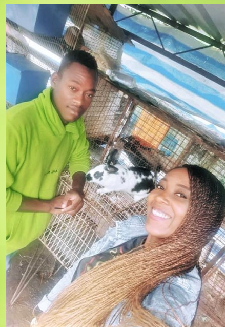
Bulawayo Youth Ambassadors visiting one of the Members' rabbitry