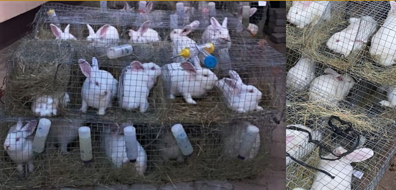
Part of the pure breed rabbits that were recently imported by Medisha from South Africa

T he Bulawayo-based corporate member of the Zimbabwe Commercial Rabbit Breeders Association (ZICORBA) has imported 50 pure breeds from South Africa to ramp up production at its rabbitry situated at the environs of Zimbabwe's second biggest city.