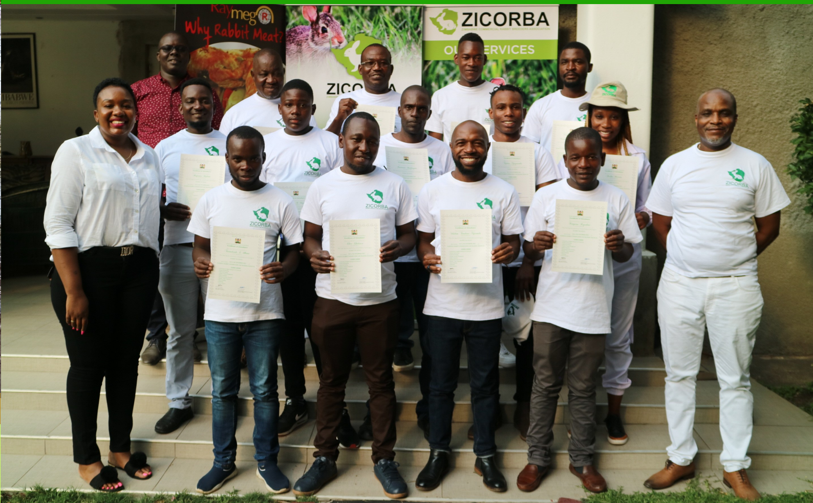
The first batch of internationally certified rabbit trainers from the ten provinces of Zimbabwe pose for a photo after certification

T he Zimbabwe Commercial Rabbit Breeders Association (ZICORBA) in partnership with Kenya's state-owned National Rabbit Breeding and Training Institute (NRCTI) have produced the first batch of internationally certified rabbit farming trainers after an intensive two-day training workshop held in Harare recently.