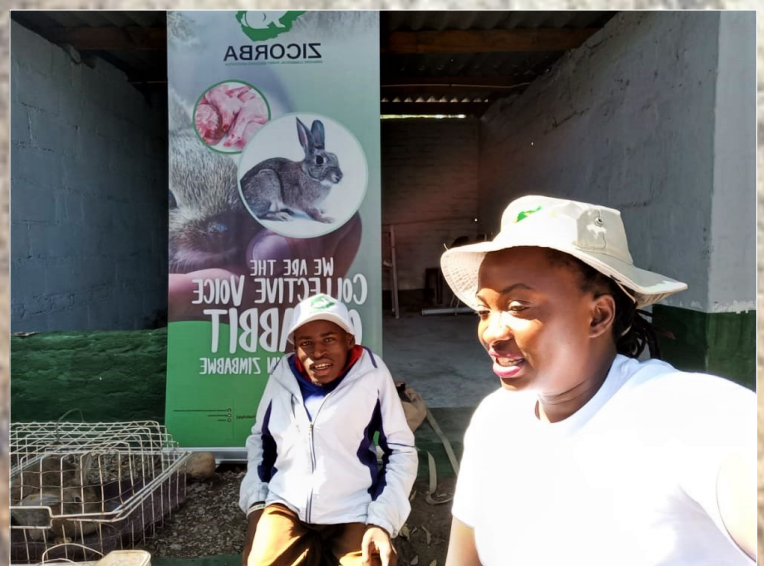
ZICORBA Masvingo chapter recently participated at the Masvingo Agricultural show which was held from 28-31 October 2021 under the theme "Open for business to sustain economic growth and stability". During the event, the chapter managed to display various rabbit breeds, engage in rabbit meat awareness through braais as well as recruitment of new members.