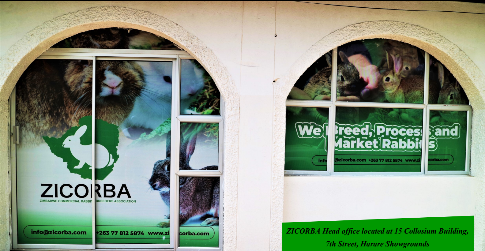
ZICORBA Head office located at 15 Collosium Building, 7th Street, Harare Showgrounds