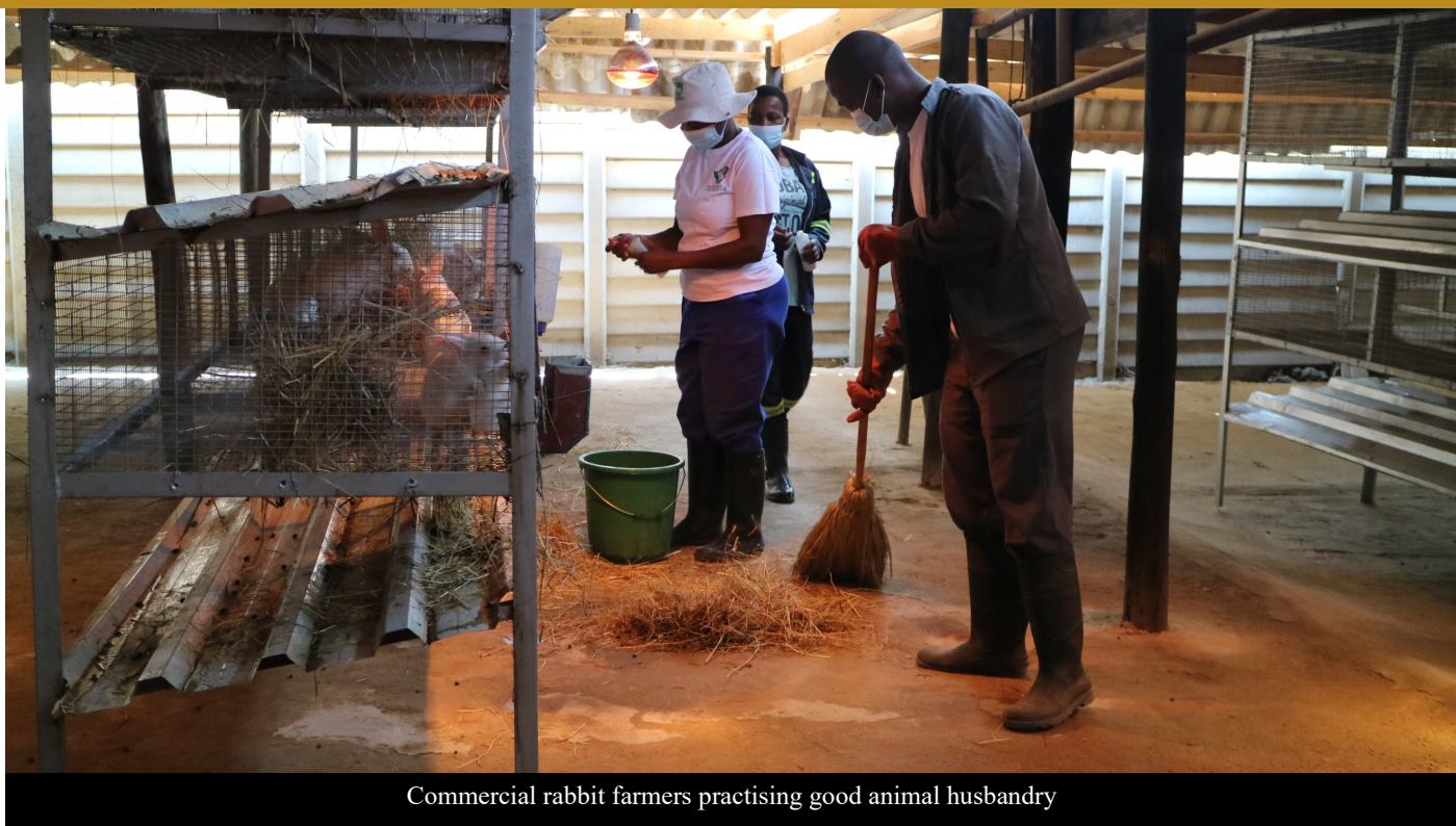
Commercial rabbit farmers practising good animal husbandry

T he Zimbabwe Commercial Rabbit Breeders Association (ZICORBA) and Kenya's state-owned National Rabbit Breeding and Training Institute (NRCTI) have joined hands to horn the production skills of Zimbabwean rabbit farmers.