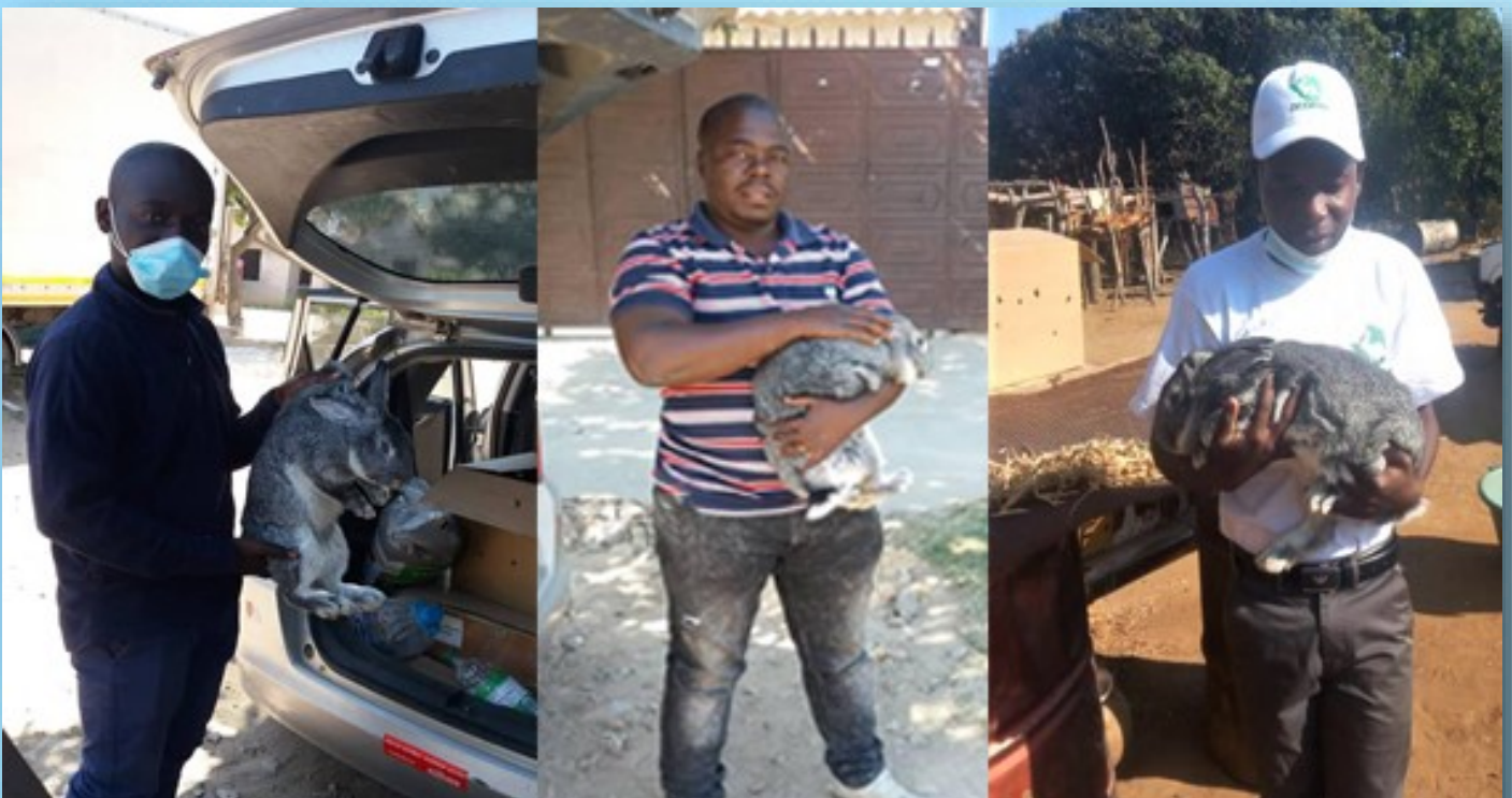
ZICORBA members in Manicaland, with their Chinchilla Giganta pure breeds donated by Raymeg Consultants Private Limited

ZICORBA, which is the only collective voice of rabbit farmers in Zimbabwe, is engaging schools, hospitals, hotels, restaurants and eateries in its nationwide campaign to popularise consumption of rabbit meat, because of its immense health benefits.