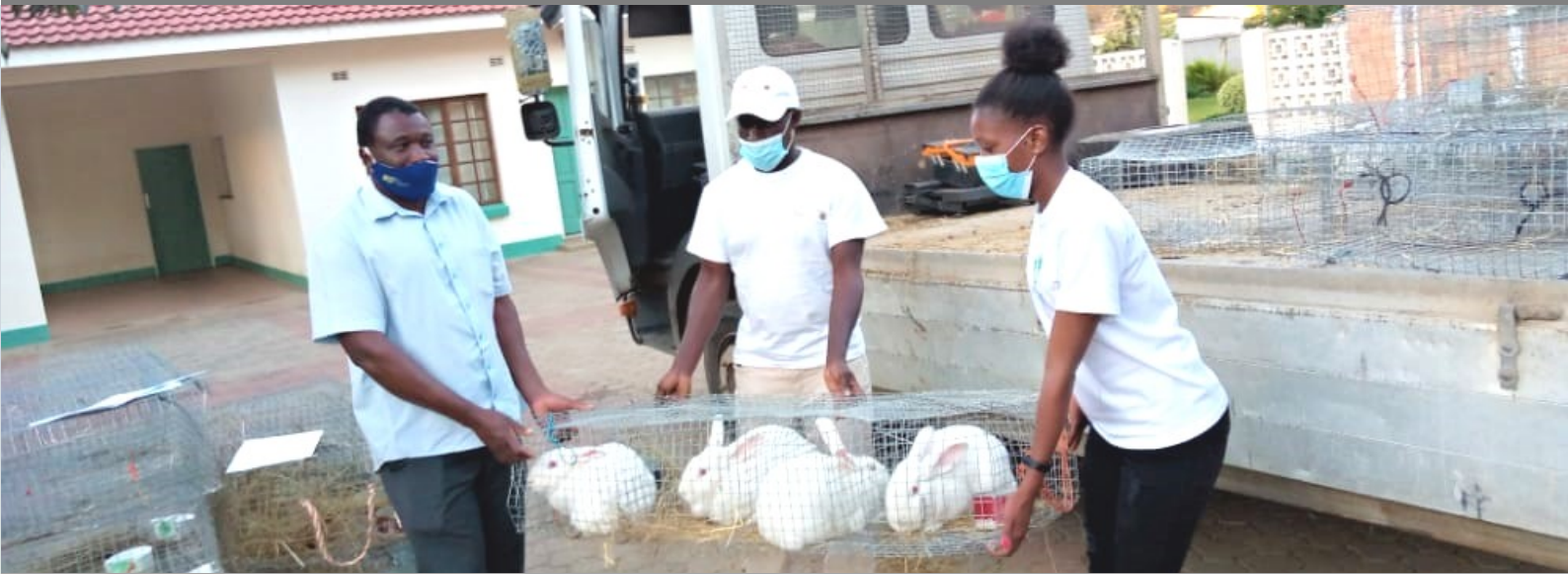
ZICORBA members in Bulawayo , receiving New Zealand White pure breeds donated by Raymeg Consultants Private Limited

Z ICORBA members based in Bulawayo and Manicaland provinces have received New Zealand White and Chinchilla Giganta pure rabbit breeds, respectively, from rabbit firm Raymeg Consultants Private Limited.