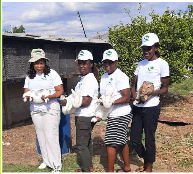
Ladies from Harare province chapter pose with their rabbits