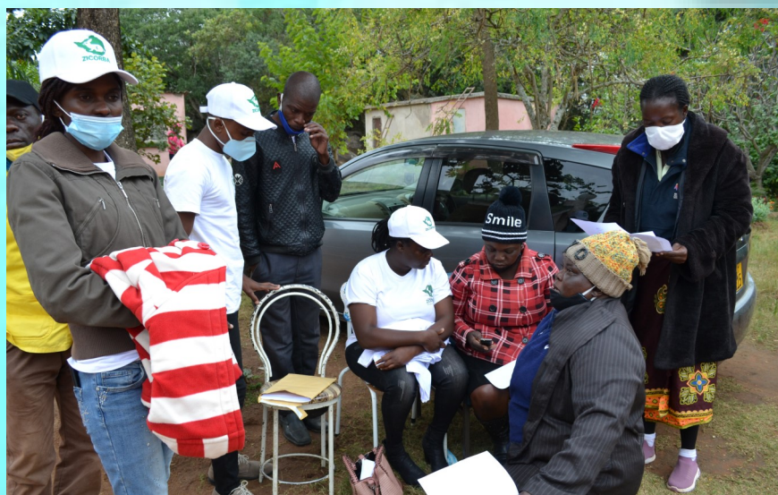
Team ZICORBA assisting potential members to fill in registration forms in Masvingo