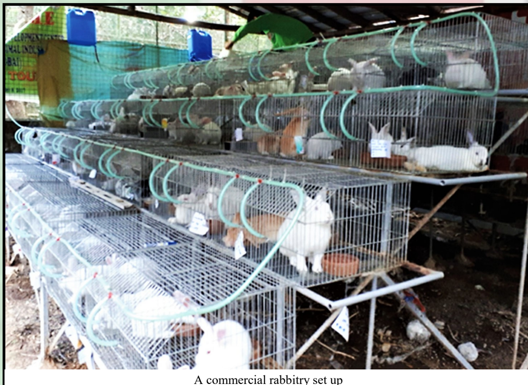
A commercial rabbitry set up

Mostly online. From the start, I would post online that I had chickens and rabbit for sale, gradually growing my trade's prominence