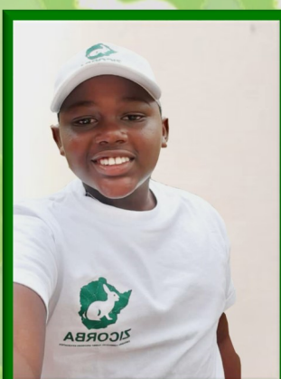
Deloitte Moyo Youth Ambassador Bulawayo